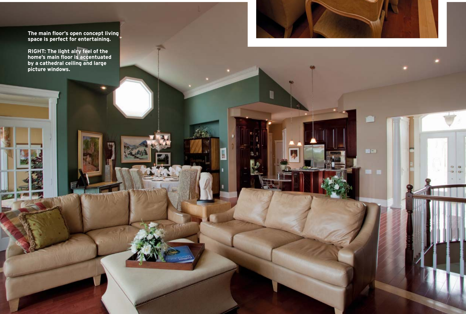
RIGHT: The light airy feel of the home's main floor is accentuated by a cathedral ceiling and large picture windows.